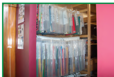
Sort out all your big books