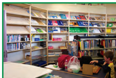
Sort out all your resources