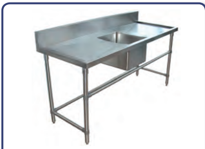
457 Single Sink Bench