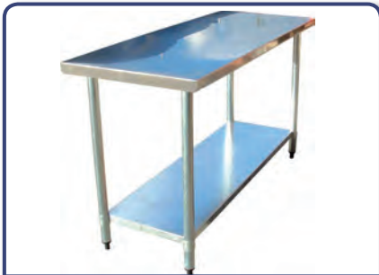
454 2 Tiered Benches