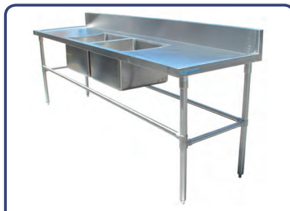
458 Double Sink Bench