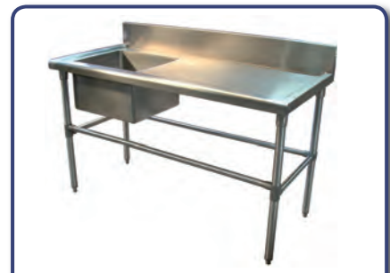
459 Single Sink Bench