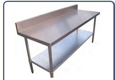
456 Bench Unit