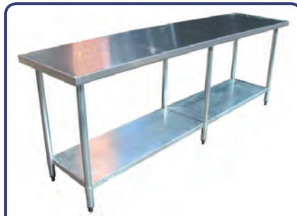
455 2 Tiered Benches